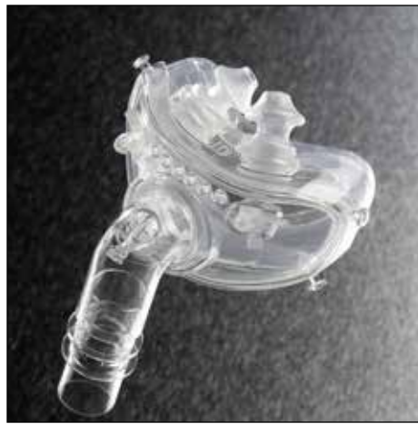
Hybrid Dual-Airway Interface (Hudson RCI/Teleflex Medical)

One of the most common reasons for failure of NPPV is patient intolerance of the mask. While oronasal masks permit mouth breathing and reduce mouth air leaks, they interfere with speech, eating, and expectoration and may cause claustrophobia. Nasal masks, while comfort-