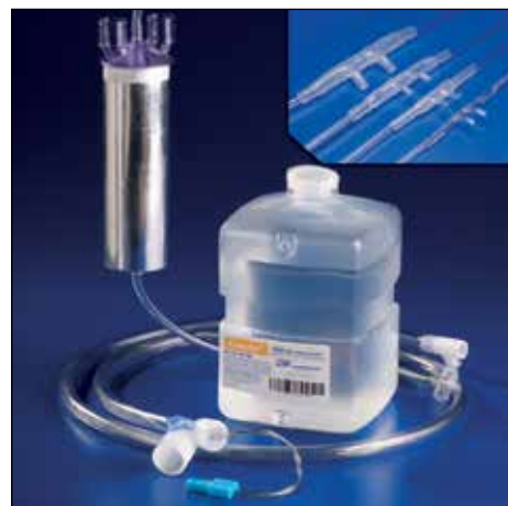
ComfortFlo (Hudson RCI, Teleflex Medical)

oxygen (or in the form of decreasing the FDO 2 requirement). Several mechanisms of action have been discussed as possible explanations. Some authors have suggested that high flows of BTPS gas can impart significant but not excessive moisture to water-deficient airways, producing a stabilizing and perhaps protective effect. This may also enhance ciliary movement and mucous clearance. (It is well-known that airways contain pressure and temperature receptors and it is conceivable that these may be stimulated by high BTPS gas flow). A few studies indicate that high nasal cannula flow creates a small degree of positive airway pressure which would explain at least in part why oxygen requirements decrease and signs of decreased breathing effort is often seen. 20 Others argue that HFT by nasal cannula can flush the anatomic deadspace of the upper airways similar to