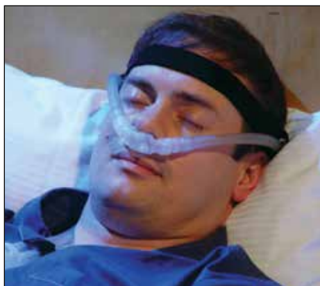
Nasal-Aire II (Hudson RCI, Teleflex Medical)

Patients are evaluated in a sleep disorders center (SDC) to see if there is a sleep disorder present and if the problem may be treated by CPAP. The SDC will often use one type of interface of the appropriate size to fit the patient's face and perform a "CPAP study" to establish the right settings (CPAP or bi-level pressure, supplemental oxygen, etc.) Should the patient have problems with the interface, another may be tried – however, most SDCs do not have a wide range of different interfaces designs since there are