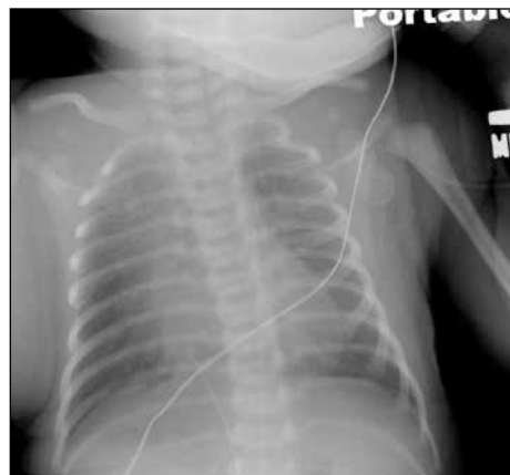
Figure 2. Chest film of patient in supine position soon after starting HFT-NC therapy.

tachypneic with f = 60-90 bpm. Pre-ductal SpO_2 was 100% on 1 L/min oxygen via traditional nasal cannula. The initial umbilical line blood gas measurement (pH 7.27, PaCO_2 = 47 , PaO_2 = 35 , base deficit = -6 , HCO_3 = 18 , and SaO_2 = 63\% ) revealed mixed acidosis. The chest radiograph revealed eight ribs expanded and was otherwise unremarkable (see Figure 1).