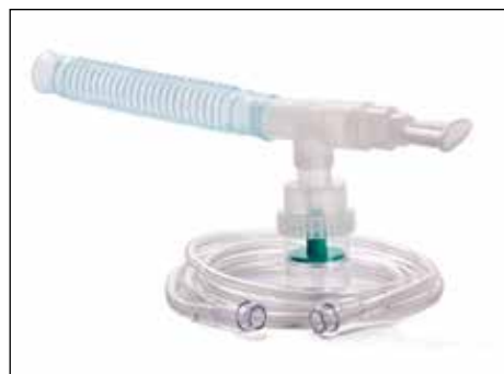
Figure 3. Small Volume Nebulizer (Teleflex Medical)

The small volume medication nebulizer (SVN) is often used when the patient is incapable of using the MDI or DPI. There are a number of advantages to using a SVN. Many drug solutions may be aerosolized that are not available by MDI or DPI and if drugs are compatible, they may be mixed in the same treatment (e.g. albuterol and budesonide). No special breathing pattern or breath holding is required. The SVN may be used by the very young, very old or debilitated patient with adequate lung deposition. Most patients inhale from the SVN through a mouthpiece or mask (Figure 3). The “blow-by” technique must not