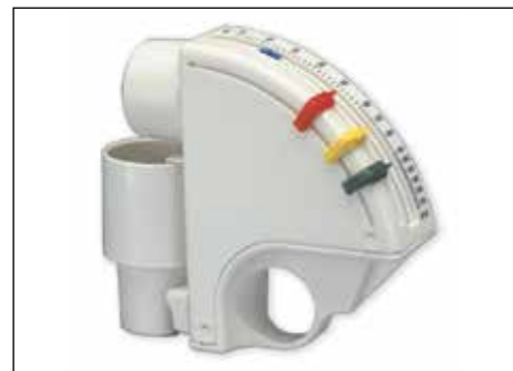
Figure 1. Pocket peak Flow Meter (Teleflex Medical)

The use of exhaled nitric oxide (FE NO ) in asthma is a recent development. Nitric oxide is a marker of inflammation in the airways, and concentration of NO 2 in exhaled air correlates with inflammation and eosinophilia in induced sputum, bronchoalveolar lavage and tissue. While there is