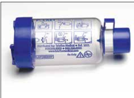
Figure 2. Anti-static pocket chamber (Teleflex Medical)

The purpose of spacers and holding chambers is to improve medication dose delivery and actuation timing (Figure 2). A spacer is a tube with a mouthpiece or mask on one end and a boot to receive the MDI mouthpiece on the other. A valved holding chamber is a tube with a boot to receive the MDI mouthpiece on one end and a 1-way valve and mouthpiece or mask on the opposite end. The 1-way valve prevents the patient from exhaling into the tube, which may displace medication and decrease the medication dose available. A spacer or holding chamber should always be used with an inhaled corticosteroid to reduce the possibility of oral infection risks. It is optional with a short-acting beta 2 adrenergic or anticholinergic medication. The technique for using the MDI with a valved holding chamber is described in Table 9*. The device should be cleaned every two weeks or as needed (Table 10*).